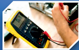
Test & Measurement